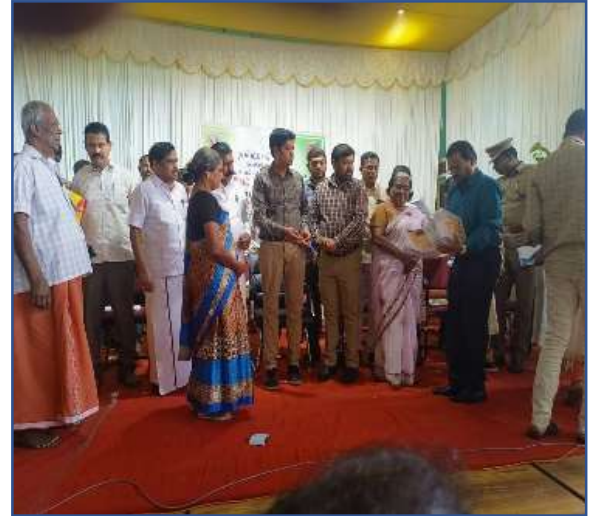
PMEGP Subsidy loan issued by the Hon.Dist. Collector