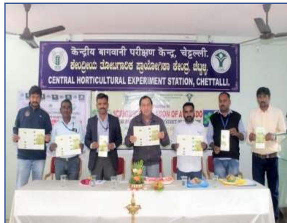
Findings of post training field visit by Scientists from Central Horticulture and Experiment Station (CHES)-Chettalli: