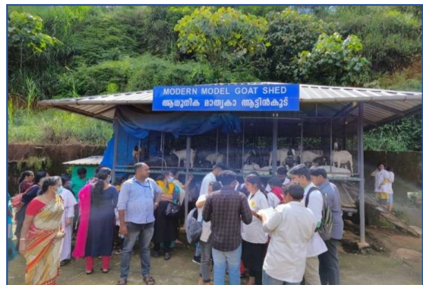
Exposure visit, indoor class and outdoor model farm visit